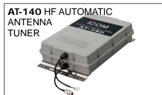
Matches the transceiver to a long wire antenna with little insertion loss. AT-130/E is also available.