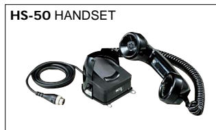
Provides clear audio reception and comes in handy for listening privacy.