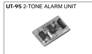
Provides the alarm function. Already built in to the Marine version.

Icom Inc. 1-1-32, Kamiminami, Hirano-ku, Osaka 547-0003, Japan Phone: +81 (06) 6793 5302 Fax: +81 (06) 6793 0013 URL: http://www.icom.co.jp/world/index.html