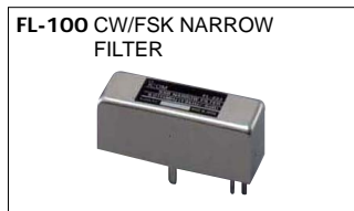
Have good shape factor to provide better CW/RTTY reception. Bandwidth: 500 Hz/–6 dB