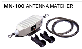
Match the transceiver to a dipole antenna. Covers all HF bands from 1.5 to 30 MHz. 8 m×2 antenna wires come attached.