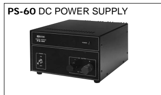
Provides 13.6 V DC (30 A) output from an AC outlet.